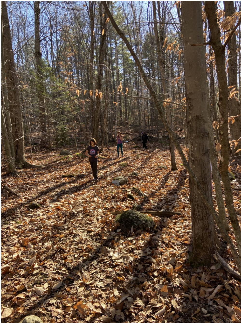
Sixth grade students at Kearsarge Regional Middle School took part in a two day outdoor learning experience earlier this school year.