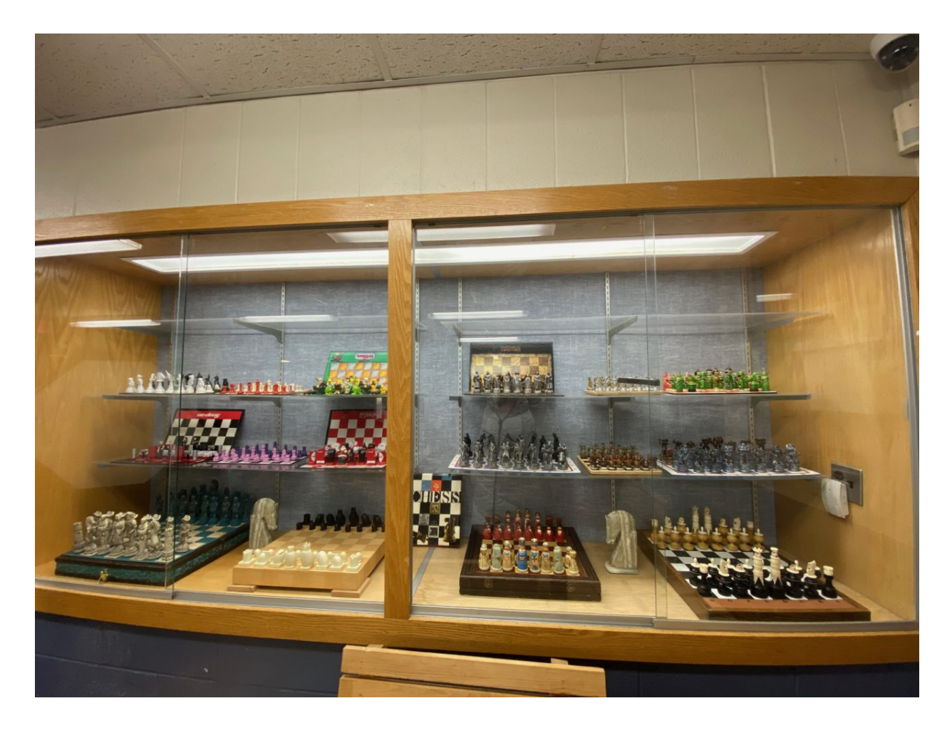
Some of Tappen's own unique chess sets are on display at the school.