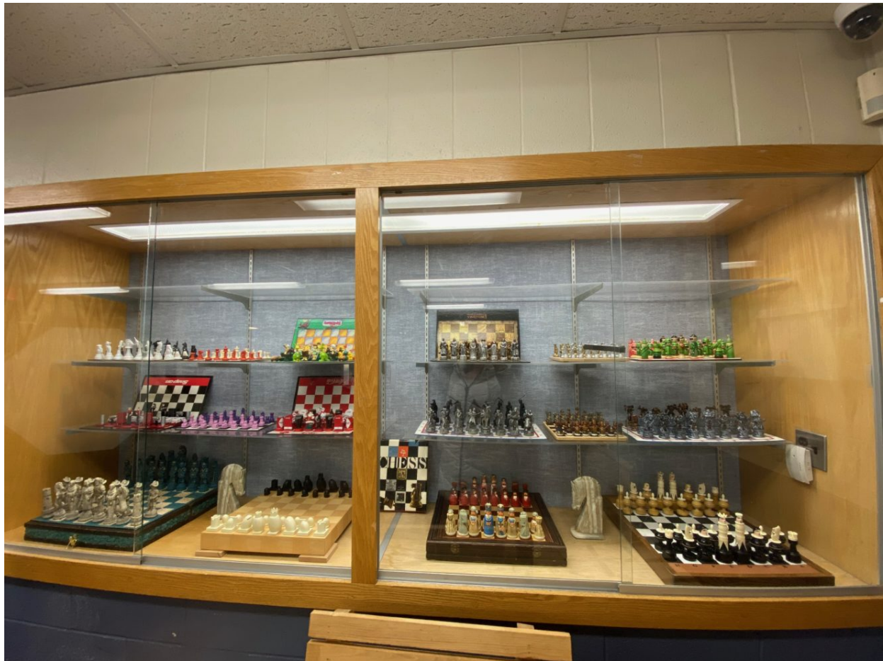
Some of Tappen's own unique chess sets are on display at the school.